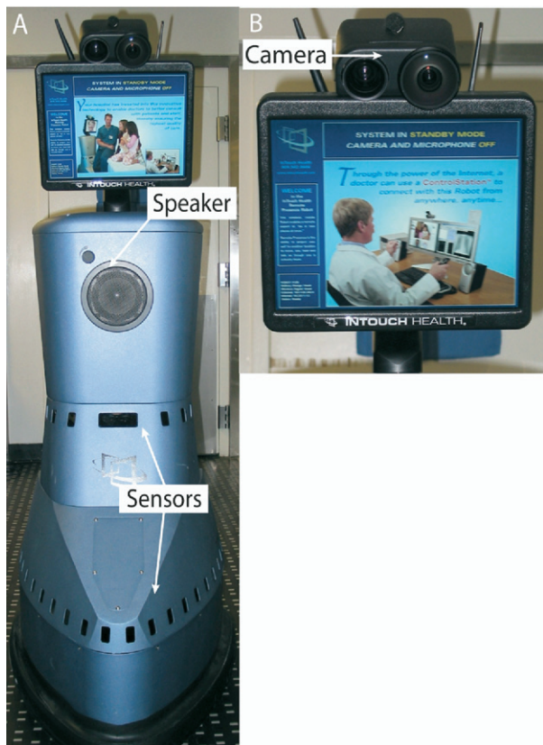
Figure 1. (A) Front view of the RP-7 robot demonstrating key components such as speaker, collision avoidance sensors around waist and base, and (B) view of the robot head including the screen, one camera for general purposes such as driving and another camera for zooming, and a microphone.

tional and tilt movements of the robot head. The zoom feature of the robot camera is easily controlled by pointing to an area of interest using touchpad controls on the laptop and dragging the cursor to expand the view, a feature that allows the consultant to interrogate areas of interest such as x-ray films in greater detail (Video Clip 1). A video input jack located along the back of the robot allows for connection of any video source such as an endoscopic camera or fluoroscopy, thus allowing the consultant to view directly the images seen by the recipient surgical team. In addition, using the image capture feature, the consultant can capture still images and telestrate items of importance directly back to the recipient on the robot screen. The total cost of RP-7 is approximately $150,000.